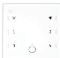
Glass Touch T6