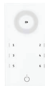
Glass Touch T6R